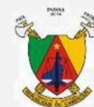
Cameroonian Ministry of Transportation